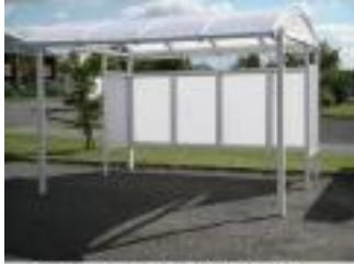
Contour Line Curved Roof Canopy Possible uses ring for quotation for your own requirements.