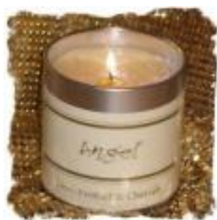
Angel Sweet honey & caramel with oriental spices & a touch of myrrh.