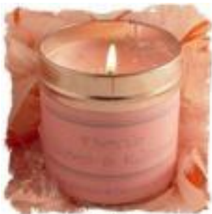
Faerie Wishes & Kisses Warm & cheeky - girly & sparkly - what a combo