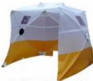
Rail Tent Translucent