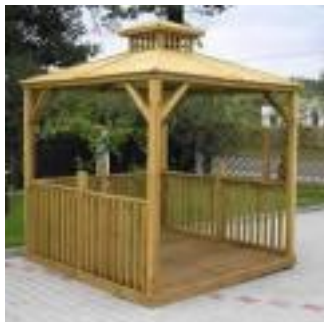
2.4 x 2.4 x 2.8 complete with decking