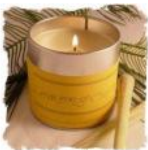
Lemongrass Fresh & lemony This aromatic grass revitalises & uplifts