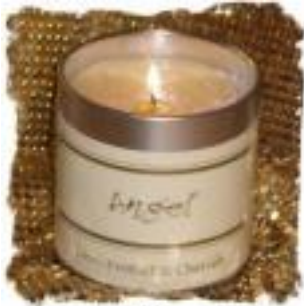
Angel Sweet honey & caramel with oriental spices & a touch of myrrh