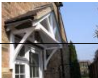
Timber Door Canopy Fleur de Lys Style 1800mm x 600mm